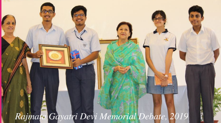
Rajmata Gayatri Devi Memorial Debate, 2019