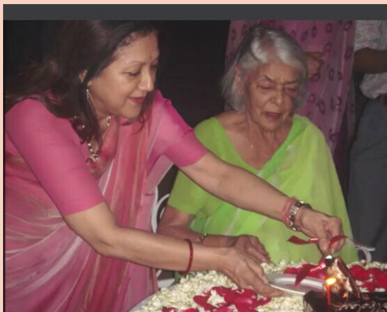
Two generations together...