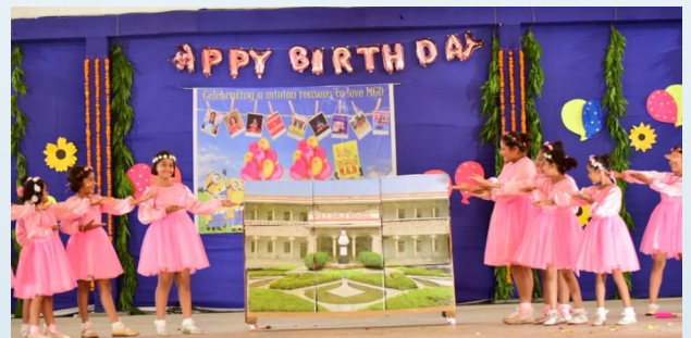
Dance performance by the Primary Section students