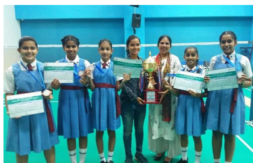
IPSC Badminton Team