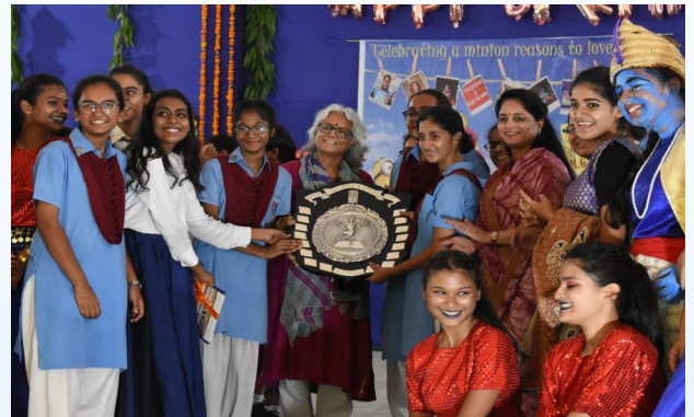
Sarojini Naidu and Madame Curie house with the winners' shield