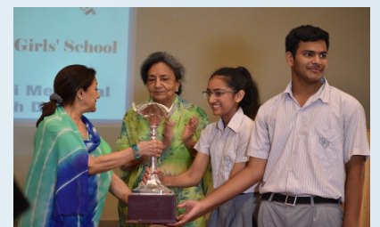
Winners, MSMSV with the trophy