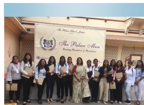
Palace MUN delegation