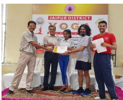
Jaipur District Open Yoga Competition