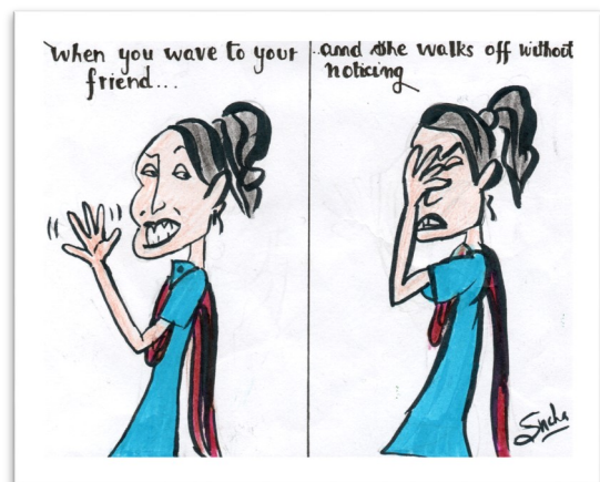
Caricatures by Sneha Jain (X-D)