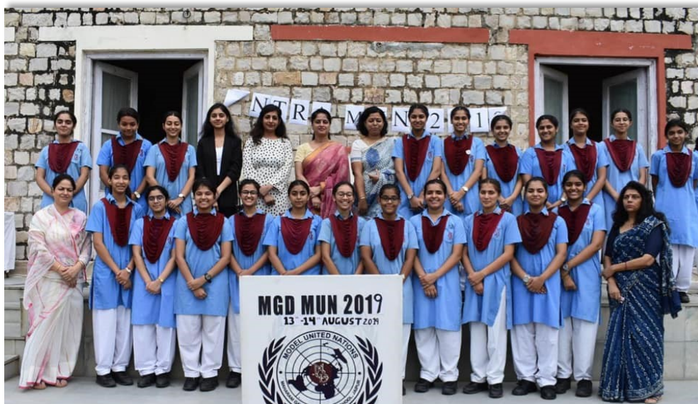
Executive Board of MGD IntraMUN 2019