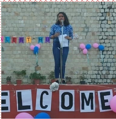
All the World's a Stage – Talent Show for Boarders