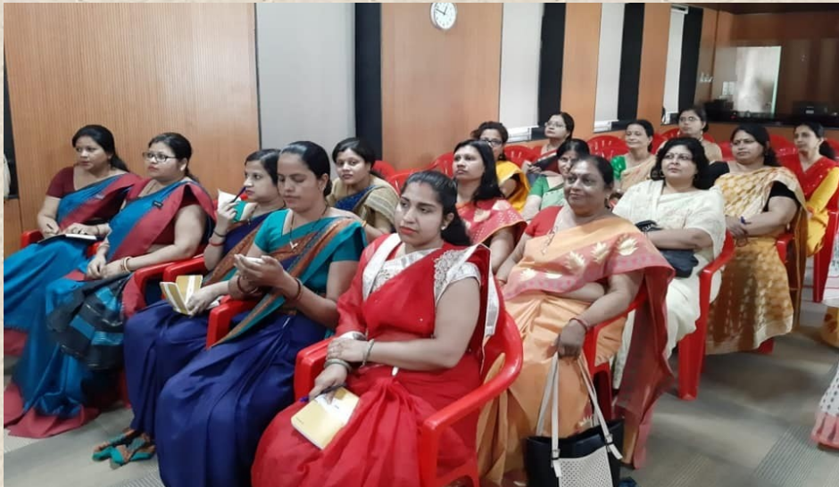
Hindi Workshop for Teachers