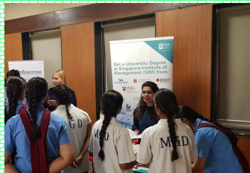
ICAE (career workshop)