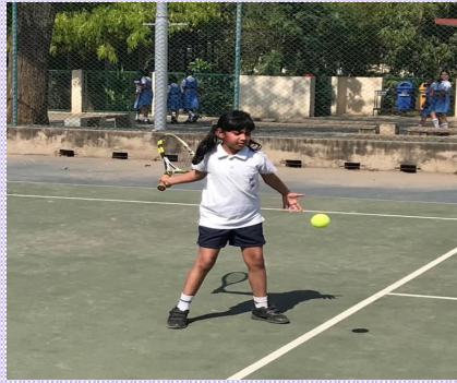
Primary Tennis Boot Camp