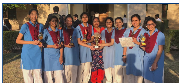
IPSC MUN team with the Best Delegation trophy