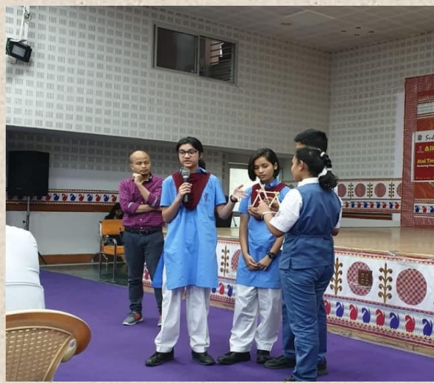
Design Thinking - Subodh Public School