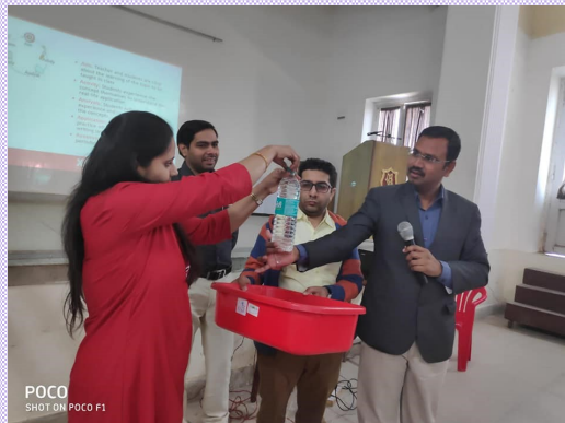
XSEED Workshop for Parents