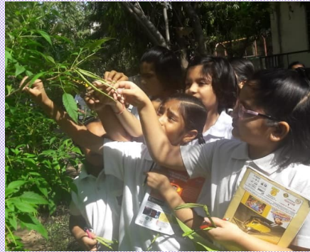
Primary Compost Making