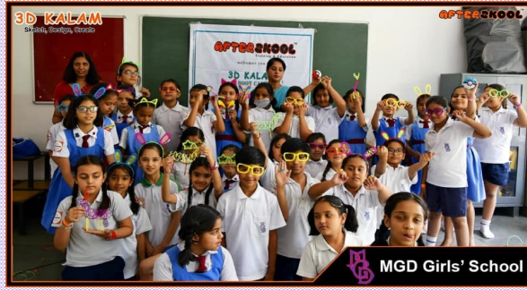
3-D Kalam Workshop for Primary