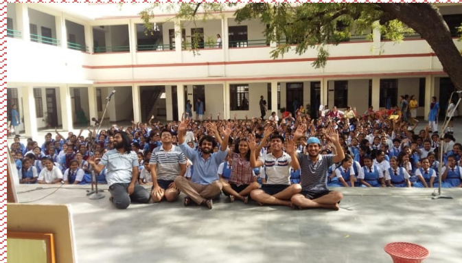
Bade Bhai Sahab - A play by Breathing Space