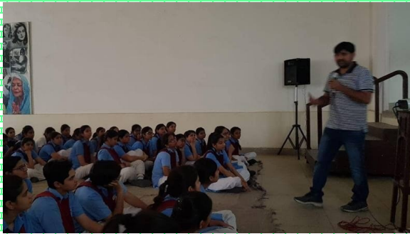
Career Counseling for CLAT