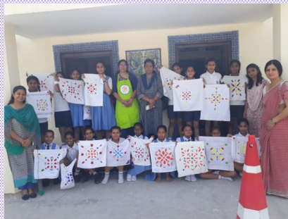
Pidlite Primary Art Workshop