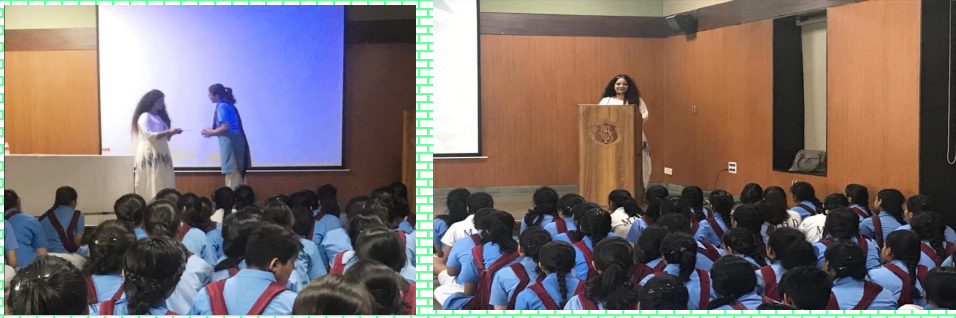
Counseling for careers in Designing