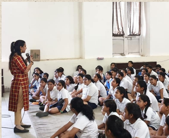
Procter and Gamble Workshop